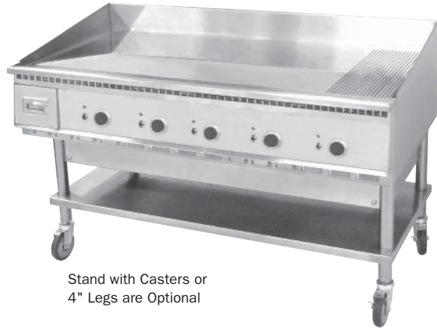
Stand with Casters or 4" Legs are Optional

The Keating MIRACLEAN® Griddle is designed to provide maximum performance with many benefits to the operator. The mirror surface is achieved in a special eight step process. Insulated stainless steel electric elements are mounted every 12" to ensure performance and recovery allowing the operator to use zone cooking for different products.