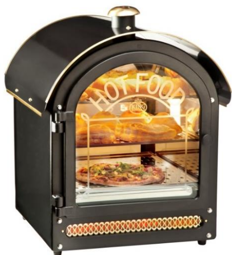
Hot Food Merchandiser Black

The ideal way to serve and display hot potatoes and many other foods, the King Edward Merchandiser is manufactured to the CE standard, and is made to the same high standards as all our other products. You may already have adequate oven capacity but do you have an attractive point of sale unit to display you're ready to serve food?