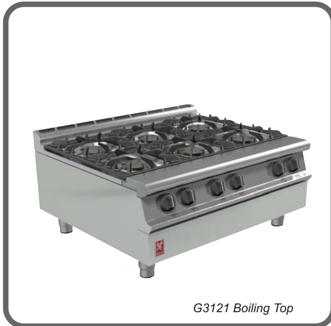
G3121 Boiling Top