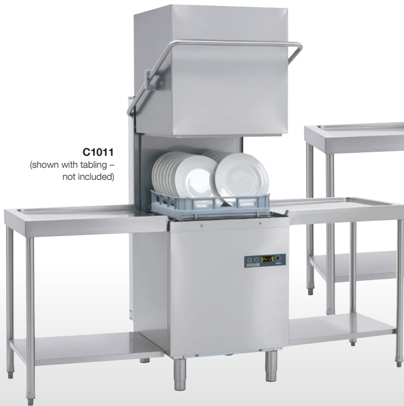
C1011 (shown with tabling – not included)