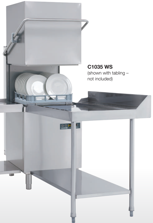
C1035 WS (shown with tabling – not included)