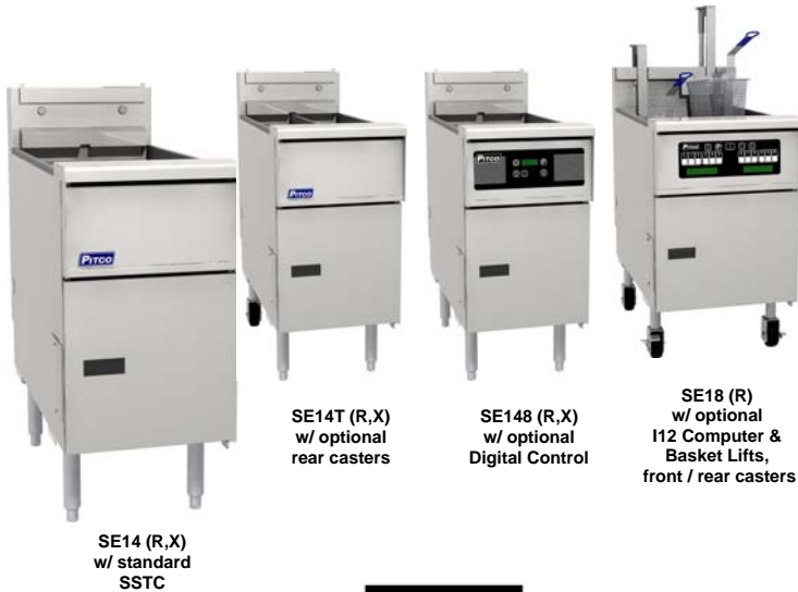
SE14 (R,X) w/ standard SSTC