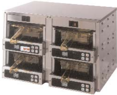
MC2W2H (shown with optional pans)

Since 1947, Foodservice Equipment That Delivers!