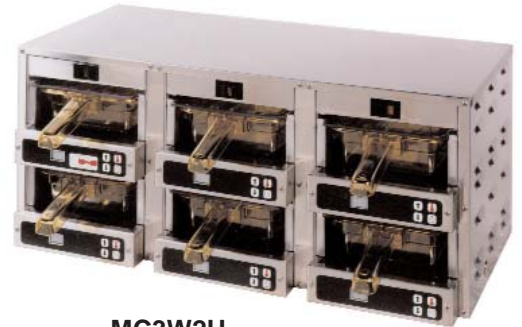
MC3W2H (shown with optional pans)