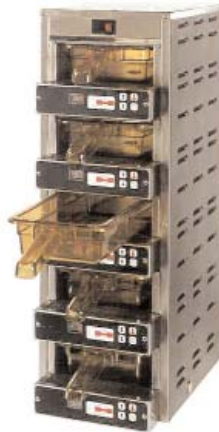
MC1W5H (shown with optional pans)